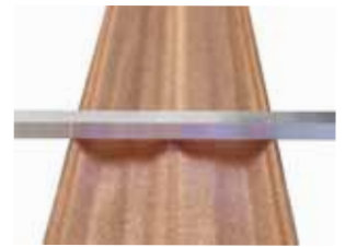
Used target (metalizer magnetics)