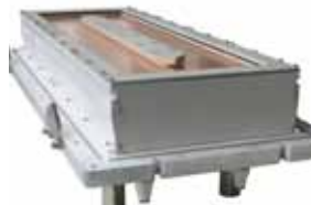
Rectangular magnetron with centre target clamp