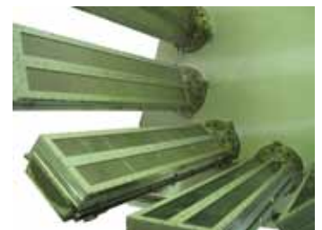
Web coating configuration involving multiple rectangular magnetrons

Constant innovation, customer satisfaction, process support, in-depth understanding, industry experts. Simply better solutions. Genco.