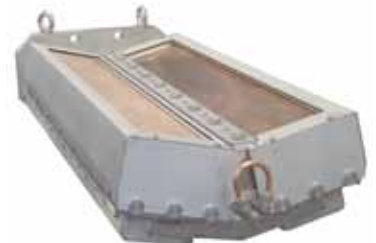
Angled dual internal cantilever