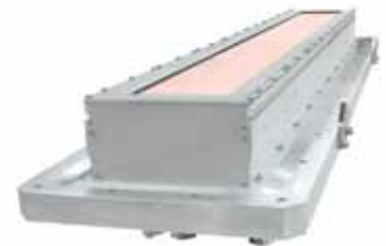
Externally-mounted rectangular magnetron