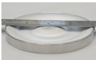
4" high yield (HY) target erosion

The 3G circular range of HV sources from Gencoa caters for applications from R&D to small scale production.